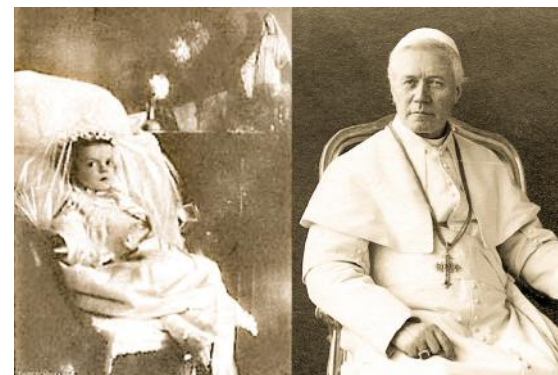
Little Nellie & St. Pius X