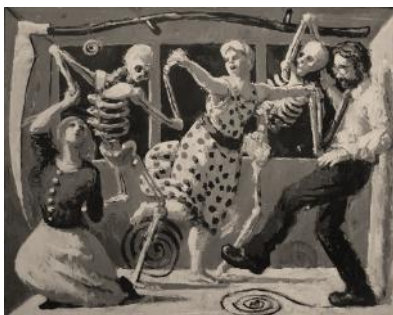
No matter what is one's station in life, the Dance Macabre unites all.

Because of our free will, we each have the possibility to live for this life or the next. Those who live for this life only are grieved by death, because they can take nothing with them of all their possessions. On the contrary, those who spend this life pleasing God and doing His Holy Will, will lay up for themselves 'a treasure unfailing in Heaven' (cf. Matt. 6:20); a happy death and an eternity of joy. Who would wish to forfeit this by the few years of empty pleasures which the world can offer?