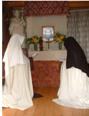
Our Annual Novena to the Holy Face of Jesus

We wish you all a holy and fruitful Lent. May it bring you to a deeper understanding and closer imitation of the suffering love of our Saviour so that you may share more fully in the glory of His Resurrection when the Passion is over in the everlasting rest of Heaven!