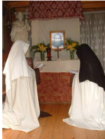
Our Annual Novena to the Holy Face of Jesus

We wish you all a holy and fruitful Lent. May it bring you to a deeper understanding and closer imitation of the suffering love of our Saviour so that you may share more fully in the glory of His Resurrection when the Passion is over in the everlasting rest of Heaven!