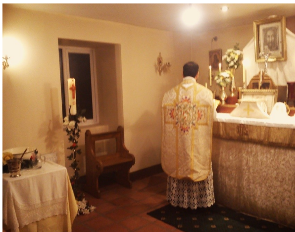
Easter Vigil Mass — 30-31 March, 2024

✓ LifeFunder : https://www.lifefunder.com/carmelitehome